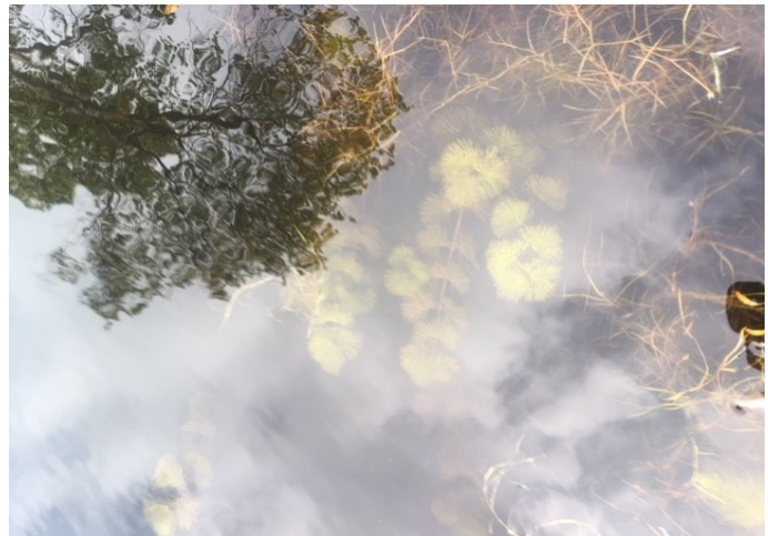
Figure 2. Rooted fanwort near the culvert at Hatch Hill reported by a resident in August 2018.

CT Agricultural Experiment Station (CAES) Aquatic and Wetland Invasive Plant Guide: Fanwort Page 2017 FBL Middle Bolton Fanwort Status Report 2011 Fanwort specimen from Lower Bolton Lake May 2018 FBL Fanwort Presentation