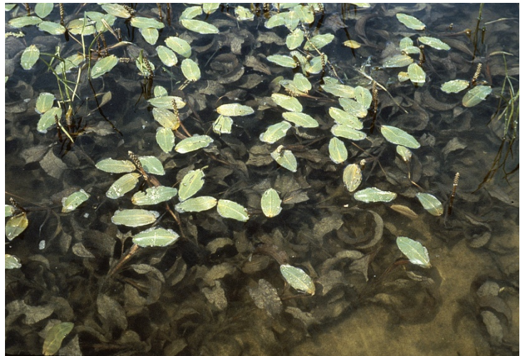
Figure 9. Broad-leaf pondweed is a native plant found in many lakes and ponds in North America.

CAES identified small patches of broad-leaf pondweed in their 2005 survey of Lower Bolton Lake. In the 2011 survey, the plant had expanded significantly near the shore in the southern half of the lake and established a smaller presence along the dam with Middle Bolton Lake. By the 2018 survey the small patches of the plant could be found nearly