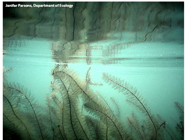
Figure 7. Variable-leaf milfoil is considered invasive throughout New England.

A chemical treatment against milfoil was carried out in Middle Bolton in August 2017 and again on July 18 th this year. The herbicides required to treat fanwort and milfoil differ and are specific to their target species. When the milfoil was treated and died off in 2017 the fanwort growing along with it became more apparent and this may be the case in 2019 as well.