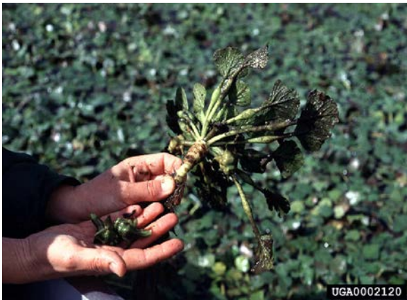
Figure 5. Three faces of water chestnut: rosette, seed, dense mat.

Water chestnut can form extremely dense mats on the surface that interfere with recreational use of the lake and can stop sunlight from penetrating the surface. This causes damage to other plants, many of which are beneficial to the lake. Because it is an annual, the plant dies off each year, sinks to the bottom and decays. The decay process lowers the level of oxygen in the water, which can result in fish-kills.