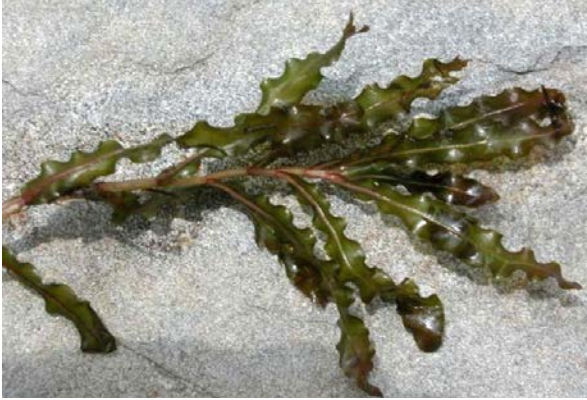
Figure 6. Curly-leaf pondweed has narrow leaves with wavy edges.

Invasive Curly-leaf Pondweed in Lower Bolton Lake was treated in 2017. The treated areas were primarily along the eastern shore in the northern part of the lake. In 2018 NEAR identified a dozen small patches around the lake's perimeter.