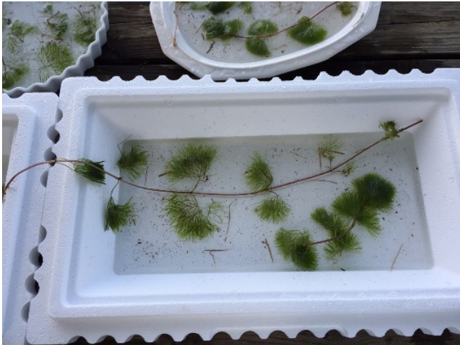
Figure 1. Fanwort has reddish stems and green fans in pairs opposite one another.

In the summer of 2017, the observant detection of fanwort in Middle Bolton Lake by FBL members and