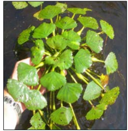
Figure 4. Surface leaves occur in rosettes with stems radiating from a central node.

Water chestnut has leaves floating on the surface rooted in the sediment by long stems. The surface leaves occur in the form of a rosette. The leaves on the underwater stem are feathery. The plant produces a small white flower in the center of the rosette which eventually results in a seed pod that drops into the water where currents spread it within the lake. Seeds can be viable for up to twelve years, though most sprout within two. Water chestnut also spreads by fragmentation, within and between water bodies.