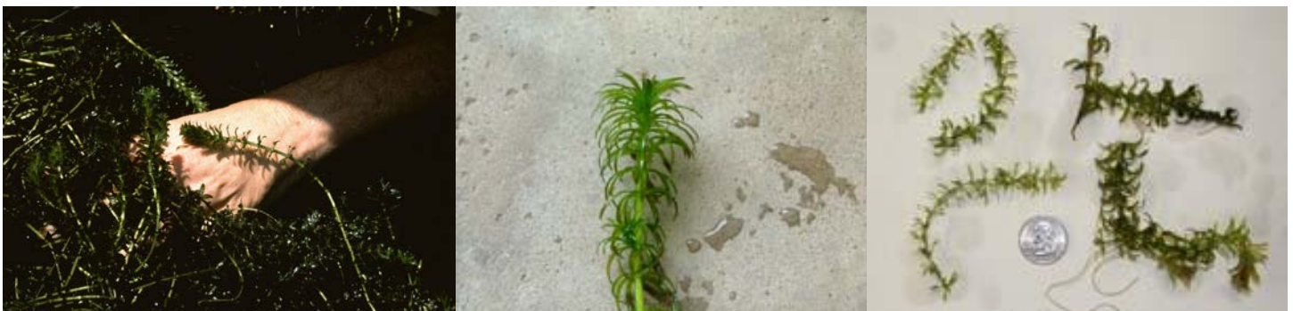
Figure 3. Hydrilla is among the most hardy and prolific invasive aquatic plants known.

Our best defense is prevention, or failing that, early detection by people using the lakes. It is critically important to report any potential sightings of hydrilla using the process given in the introduction.