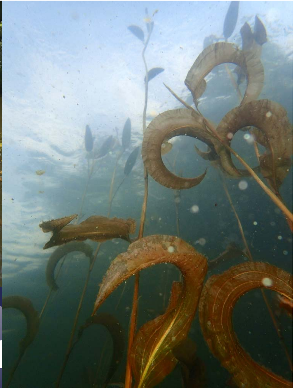
Native: Large- Leaf Pondweed Potamogeton amplifolius